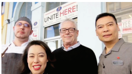
[Cleve Jones, center, with UNITE HERE members]

“UNITE HERE! HAS A LONG, PROUD RECORD OF REAL SUPPORT FOR LGBTQ WORKERS,”